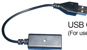
USB Cable (For use with Charging Units)