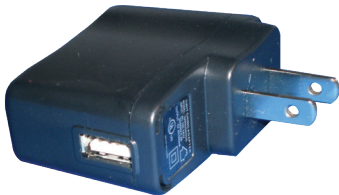
Wall Charger (For use with USB Cable)